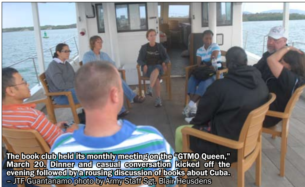
The book club held its monthly meeting on the "GTMO Queen," March 20. Dinner and casual conversation kicked off the evening followed by a rousing discussion of books about Cuba.