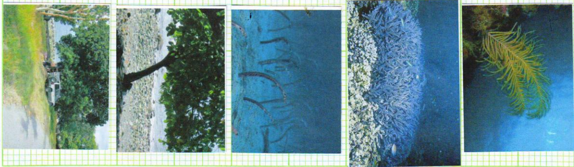
2 mm Square 20 cm x 24 cm 40s

CHIMNEY POINT By KIM GLENV & PAMELA MARTIN July 2012