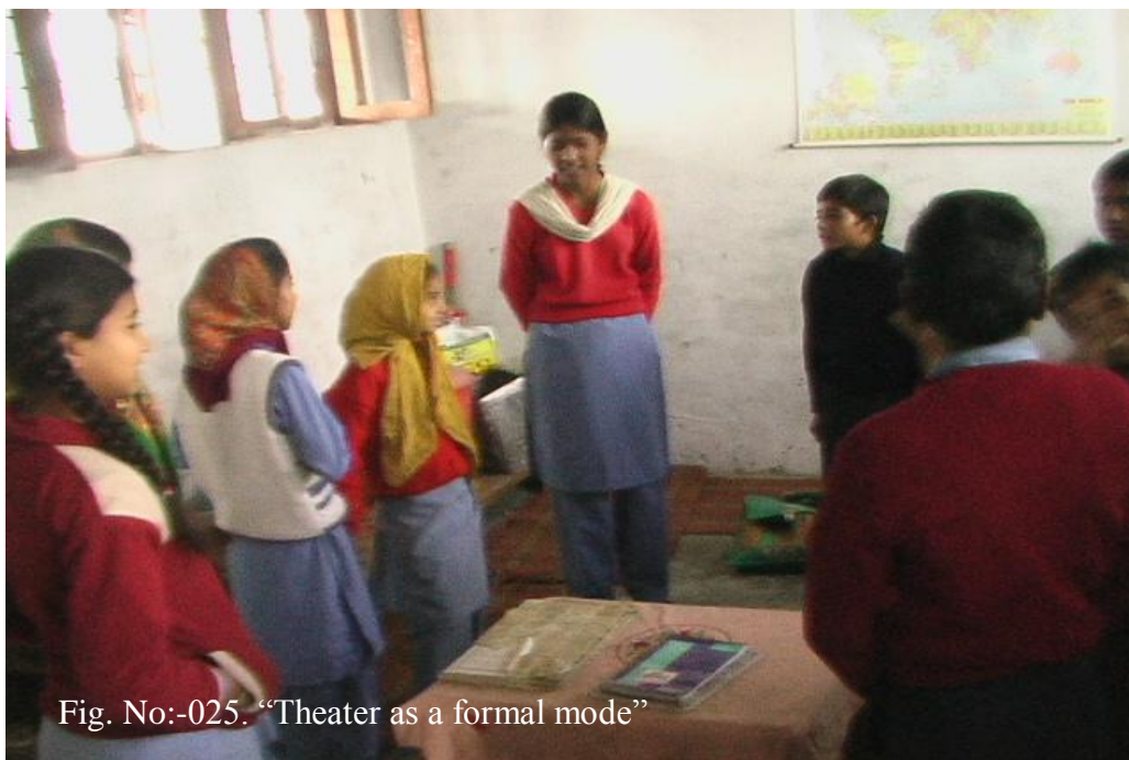
Fig. No:-025. "Theater as a formal mode"