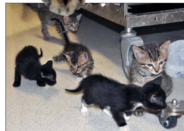
Kittens at the Morale, Welfare and Recreation (MWR) Veterinary Clinic play near their cages Oct. 13. The kittens are ready for adoption.