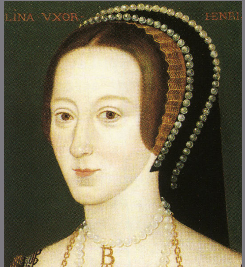
Anne Boleyn, Unknown, late 16 th century