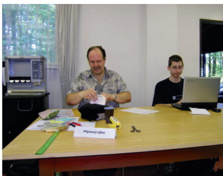
Licence CC-BY-SA 3.0.