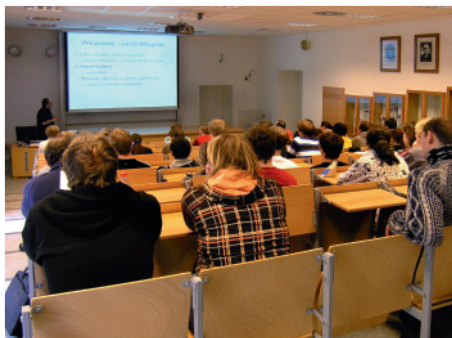
Licence CC-BY-SA 3.0.