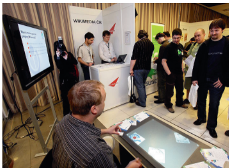
Licence CC-BY-SA 3.0.

The mostly administrative and preparative activities of the board and the association members operated in 2008 became the basis of the advanced degree of activities at the beginning of the 2009 year. It reflects the extended plan of activities for 2009 approved by members in a mail vote together with the corresponding balanced budget.