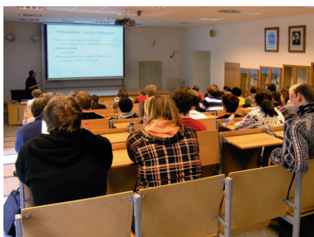
Licence CC-BY-SA 3.0.