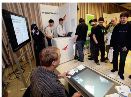
Licence CC-BY-SA 3.0.

The mostly administrative and preparative activities of the board and the association members operated in 2008 became the basis of the advanced degree of activities at the beginning of the 2009 year. It reflects the extended plan of activities for 2009 approved by members in a mail vote together with the corresponding balanced budget.