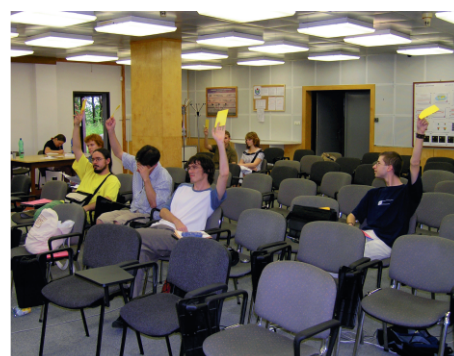
Licence CC-BY-SA 3.0.