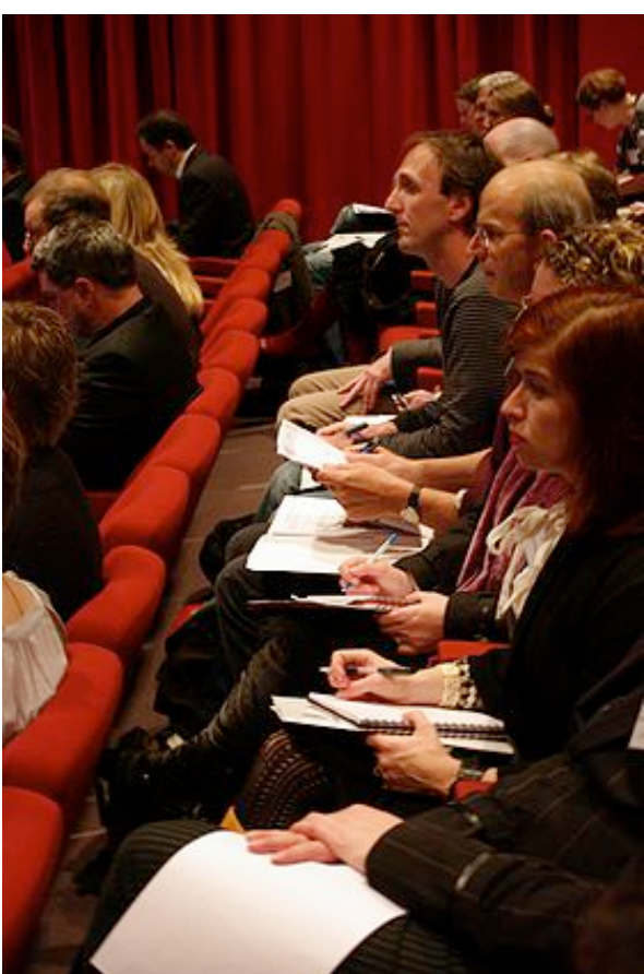
by: Gnangarra cc-by 3.0