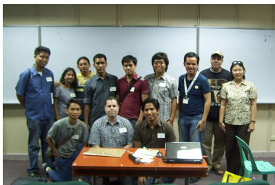
Participants of the First Annual Meeting

Just a month old, Wikimedia Philippines held its First Annual Meeting at the Bulwagang Manileño of the Pamantasan ng Lungsod ng Maynila in Intramuros, Manila on May 15, 2010. The meeting drew 16 participants, including all the members of the Board of Trustees.