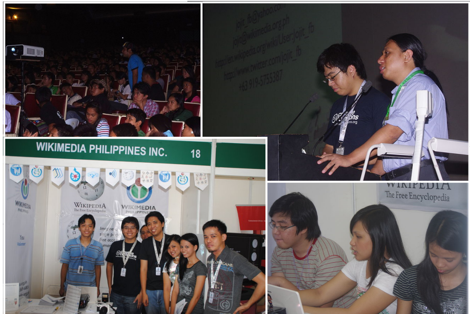
Wikimedia Philippines at the Youth Congress in Information Technology

The four-day event attracted more than 20,000 participants, mostly students from various colleges and universities all over the Philippines. Members of the academe and several IT professionals were also present. A total of 2,442 visitors who passed by WMPH's booth and signed the guestbook took with them Wikipedia souvenir pens.