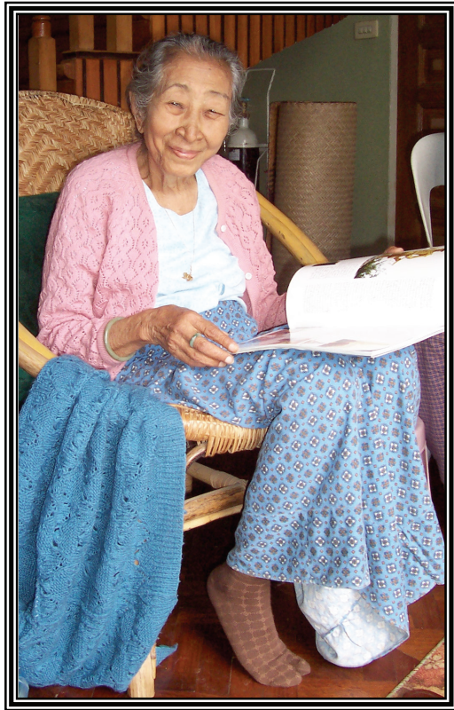
Ludu Daw Amar Circa 2003