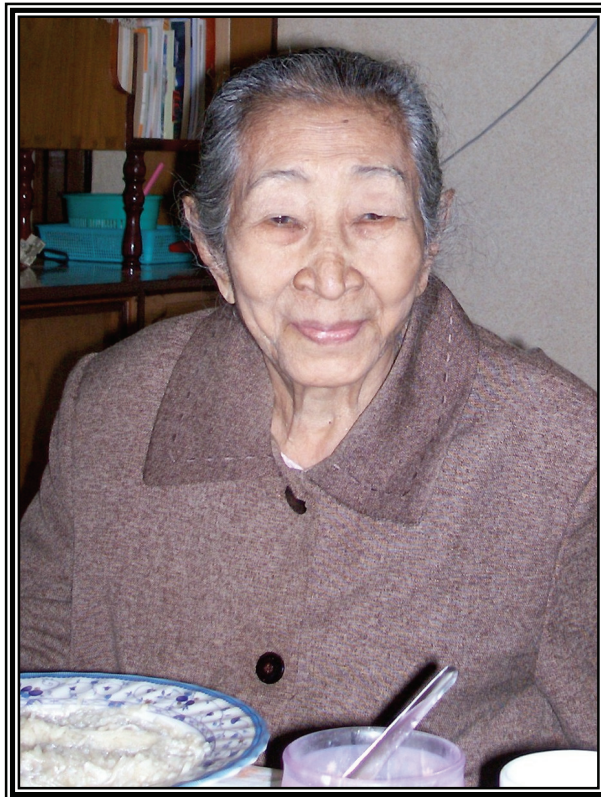
Ludu Daw Amar Just before lunch, Circa 2005