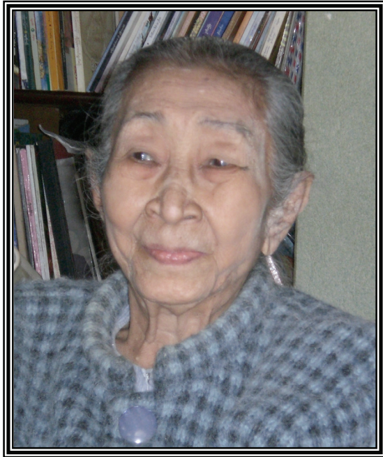
Ludu Daw Amar May 15, 2007