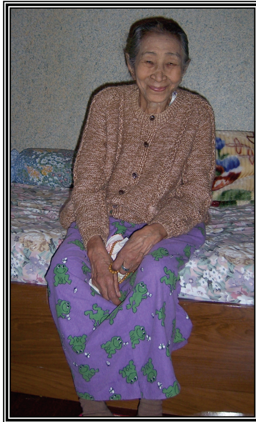
Ludu Daw Amar Circa 2006