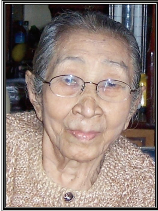
Ludu Daw Amar Circa 2006