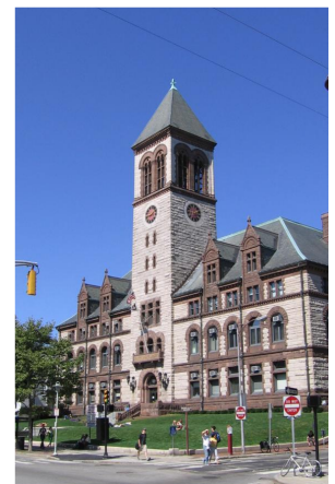
Wikimania 2005 in Harvard Law School, Cambridge, USA