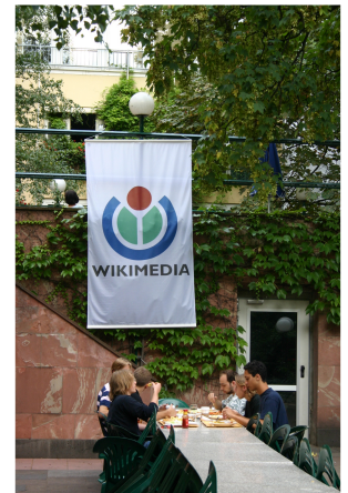
Wikimania 2005 in Frankfurt, Germany

A mini technical conference is held during Wikimania. "Hacking Days" attracts MediaWiki developers and Open Source techies. Through various presentations and workshops, attendees learn about MediaWiki and future releases, as well as about important initiatives in the Open Source movement. Additionally, developers have the opportunity to do some relaxed hacking, while catching up with their Open Source colleagues. The Citizen Journalism is mini unconference that brings together individuals from around the world to discuss the principles, techniques, tools and business models relating to citizen journalism. The event is considered an "unconference" because audience members are considered the experts, and only moderators are present to lead discussions.